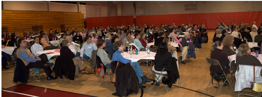
A sectioned-off portion of the Reading Massachusetts Memorial High School Hawkes Field House was the venue for the World Café.

While the idea to host this event began with just a few people, over the course of the eight months it took to implement the World Café, the concept captured the interest and curiosity of many others.