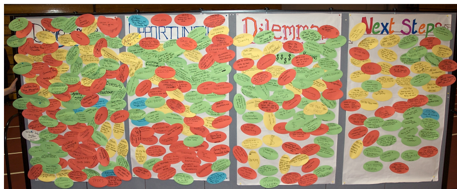
“Desires, Opportunities, Dilemmas, and Next Steps.” Clearly from this group there were more “desires” than any other category.

At the end of the evening, the participants were asked to capture on large sticky notes (one idea per note) their ideas about dreams, opportunities, dilemmas, and next steps for the town. Notes were collected and posted on large templates located in the front of the room